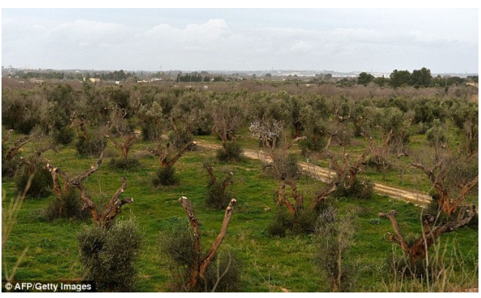
Fig. 20 Infected olive trees in Salento, Southern Italy

The future seems even more worrisome when reading about the recent news about the so-called Xylella . The Xylella fastidiosa is one of the most dangerous plant pests in the world and four subspecies are known currently. In October 2013 the subtype Xylella fastidiosa pauca was found infecting olive trees in the region of Apulia. Since at first it was only present in Central America it is likely that it was shipped into Europe with an infected plant. It is spread by the insect Philaenus spumarius or "Meadow Froghopper". While it stings the tree to drink its juices, it excretes a foam that acts as a vector for the bacterium, spreading it into the tree. The insect itself does not produce the bacterium, it can only be spread from an infected plant to a healthy one. The young saplings of the olive trees are infected first and cause the tree to dry out from top to bottom.