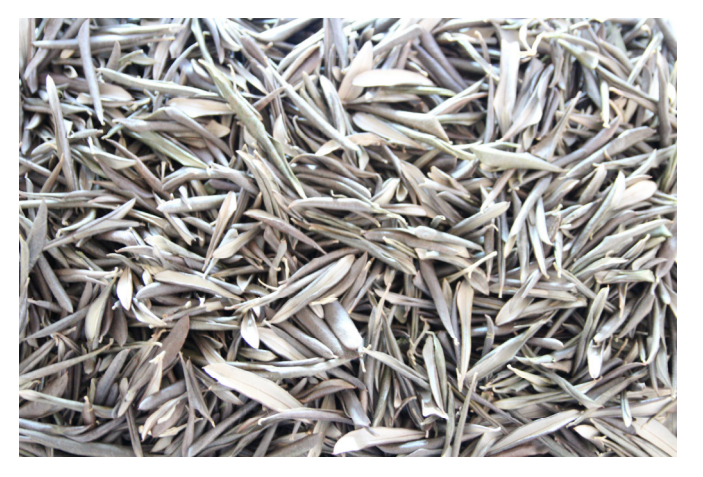
Fig. 28 Dried olive leaves for tea

During my research I found an ancient recipe for making a sort of bitter out of olive leaves. Some attempts were made and now we use the liqueur for our own use. Still the possibility can be considered to introduce it into our list of products for sale.