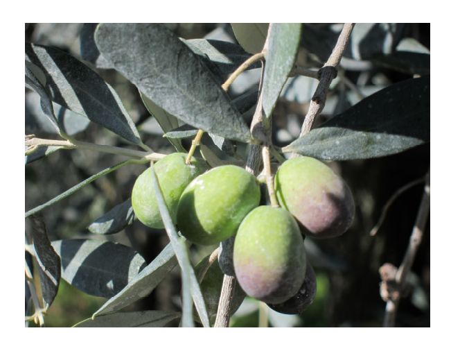
Fig. 11 Olive right before harvesting

Harvesting that starts at the beginning of October, which is generally one month earlier than other Tuscan producers, is concluded not later than the end of October. A team of 8 to 10 people needs about 15 working days. The team is divided into three different groups: one group is in charge of the nets, one group shakes the olives from the trees and the last one gathers the olives.