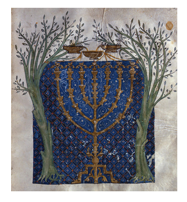
Fig. 3 Seven- branched Menorah from the Cervera Bible in Lisbon (Weekly Torah Commentary)

For the three major Mediterranean religions, Christianity, Judaism and Islam the olive tree has the meaning of vitality, fertility and peace and stands for hope and wisdom equally. For example, the Jewish Menorah (Fig.) stood between two olive trees whose fruits supplied the lamps with oil. Also for Islam the oil of the olive tree was holy for its light giving properties. For instance, the 24th Surah of the Quran is named " El Nur ", The Light. "It is lit from a blessed tree, an olive tree…" as it is written in the 35th section of the Surah . And finally in the Bible the olive tree or its oil is mentioned 250 times. In the Old Testament the olive branch that the dove brought back to Noah's arch symbolizes a new beginning and God's reconciliation with man. "Let there be light!" is one of the most important phrases of the biblical Creator. On the altars of Catholic churches burns the eternal light fed even today by olive oil. Furthermore olive oil was necessary for all religious ritual anointing.