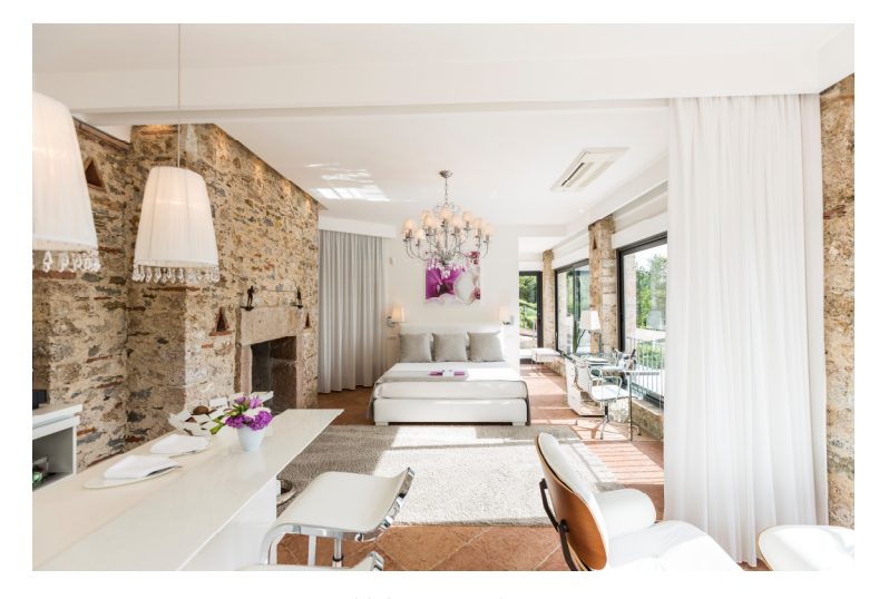
Fig. 22 Suite at II Casone

We offer a kind of luxury nobody really associates with this type of tourism and call it, for the lack of a better word, luxury agriturismo. The customer can experience the tranquillity of the landscape without renouncing the comfort of modern life. Therefore all suites contain amenities such as: a satellite full-screen TV, a private bar, a blu-ray player, an iPod with station, an iPad and a wireless internet access as well. All the suites have an interior décor were the modern mixes with the old structure, creating a lovely contrast. Furthermore all guests have access to the outside pool area and have towels, water mattresses and all sorts of toys or fitness equipment at their disposal.