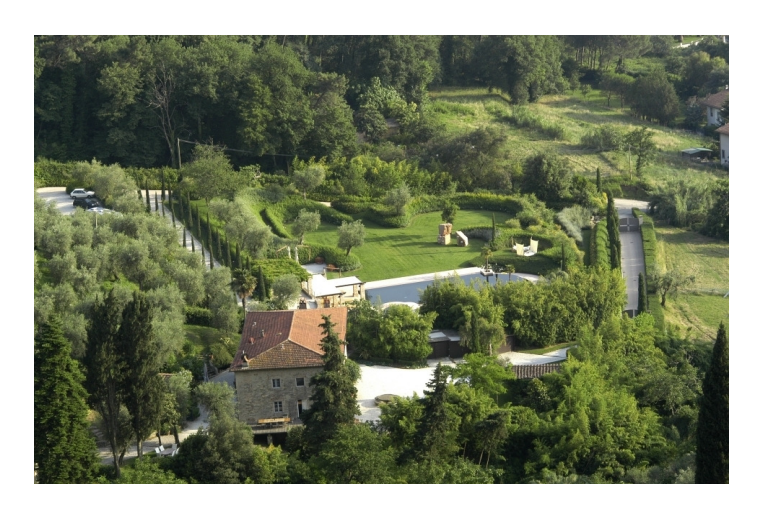
Fig. 6 II Casone