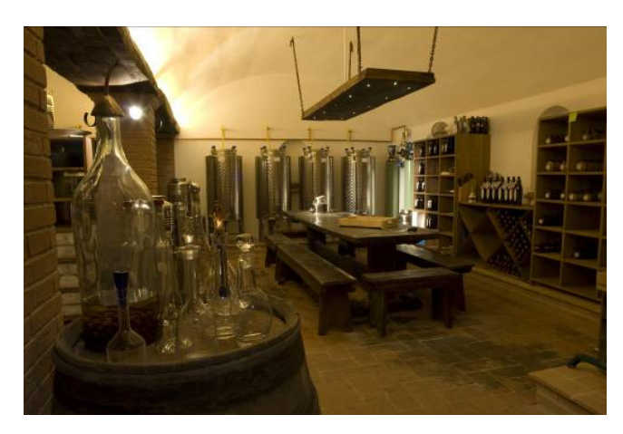
Fig. 16 The cellar of II Casone

Before being bottled, the oil is poured into steel containers of 300 I and stored at a temperature between 13 and 15 °C, under vacuum, in a nitrogen-based environment and in total darkness. Since the oil should reach the customer in perfect condition the oil is exclusively bottled when ordered.