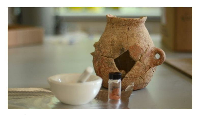
Fig. 4 One of the clay pots reconstructed from shards found at the site near Ein Zippori at the Lower Galilee.

There are many theories on how the olive tree spread through the Mediterranean countries, from where it originated, or since when people started to press oil from its fruits. It is a fact that on the Aegean islands 50,000 – 60,000 years old fossilised olive leaves were found. In settlements dating back to the Upper Paleolithic era (35,000 – 8,000 BC) olive seeds were excavated. In the end of 2014 excavations near the province of Galilee (Israel) attracted a lot of attention. Archaeologists found 8,000 years old shards of containers with remains of olive oil in the excavation site of Ein Zippori . This means that olive oil consumption was already present during the Bronze Age (Times of Israel Staff, 2014).