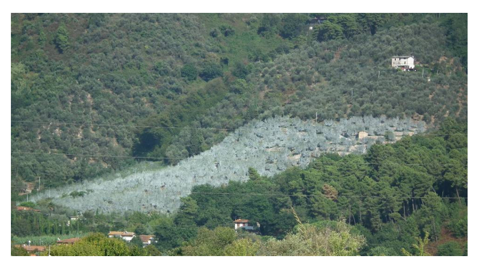
Fig. 10 The sprayed olive grove

Generally the product is sprayed 6 to 8 times from July to September. It is necessary to use it so often because for one thing the fruit grows and for the other it has to be applied again immediately after rain. Compared to traditional pesticide-based defence, the kaolin treatment is expensive, not only because the product itself costs much more than pesticides but also because it's very labour-intensive. Two workers need three days to spray the whole olive grove once.