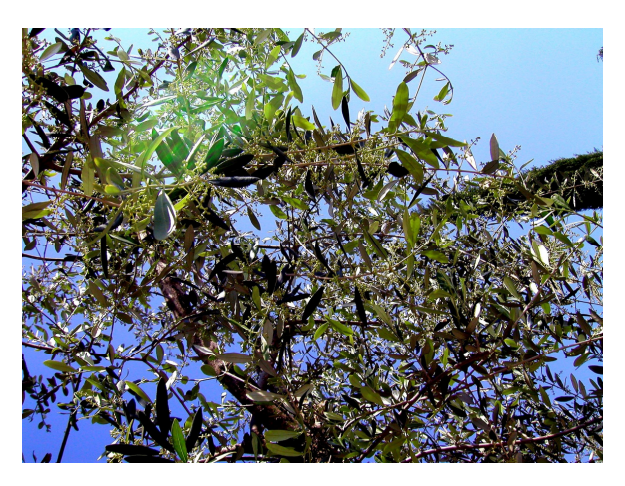
Fig. 9 Olive blooming

May is the month of blossoming, which must be monitored carefully. One hundred blossoms usually develop into one to three olives. In case of deficiency the tree can be treated with a product based on boron.