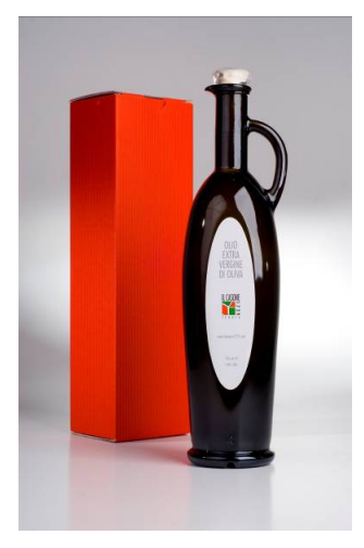
Fig. 17 Standard bottle