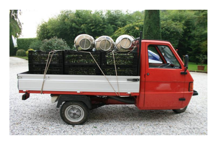
Fig. 14 The so called "ape" with which the olives are transported to the oil mill

Il Casone has developed a business relationship with a very modern oil mill which guarantees the immediate processing. Today the individual steps - washing, crushing, mixing, separating the oil through decanting/centrifugation and filtering - are performed by steel machines. A computer monitors the whole process to make sure the temperature never exceeds 28 °C. Additionally there is an agreement between Il Casone and the oil mill that prior to every pressing process the mill is stopped and given a thorough cleaning. This guarantees that no remains of the predecessor's oil will be mixed with Il Casone's oil and also that the temperature is lowered by several degrees. During the whole pressing procedure one of the Il Casone's workers is present. When the oil is ready he immediately takes it back to the company's cellar.