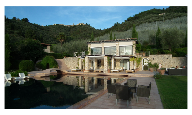
Fig. 21 Pool II Casone