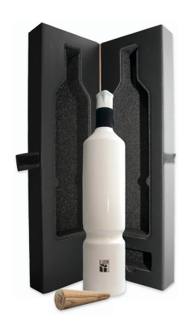
Fig. 18 Gift edition