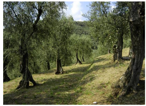
Fig. 7 State of the olive grove when the works began Fig. 8 The olive grove now