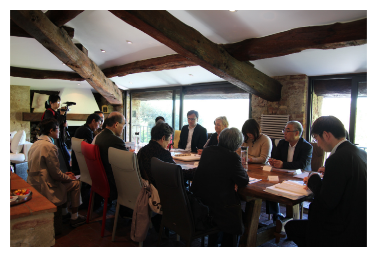
Fig. 23 Meeting with Ishikawa delegation