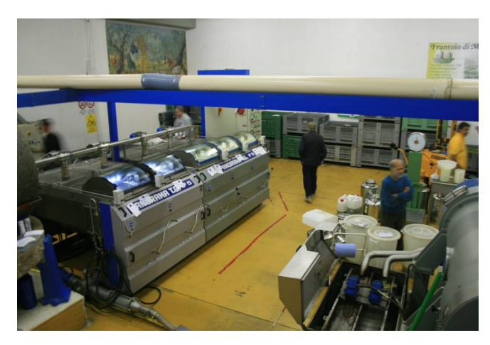
Fig. 15 The oil mill of Massarosa